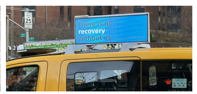
Nonprofits Make New York Coalition